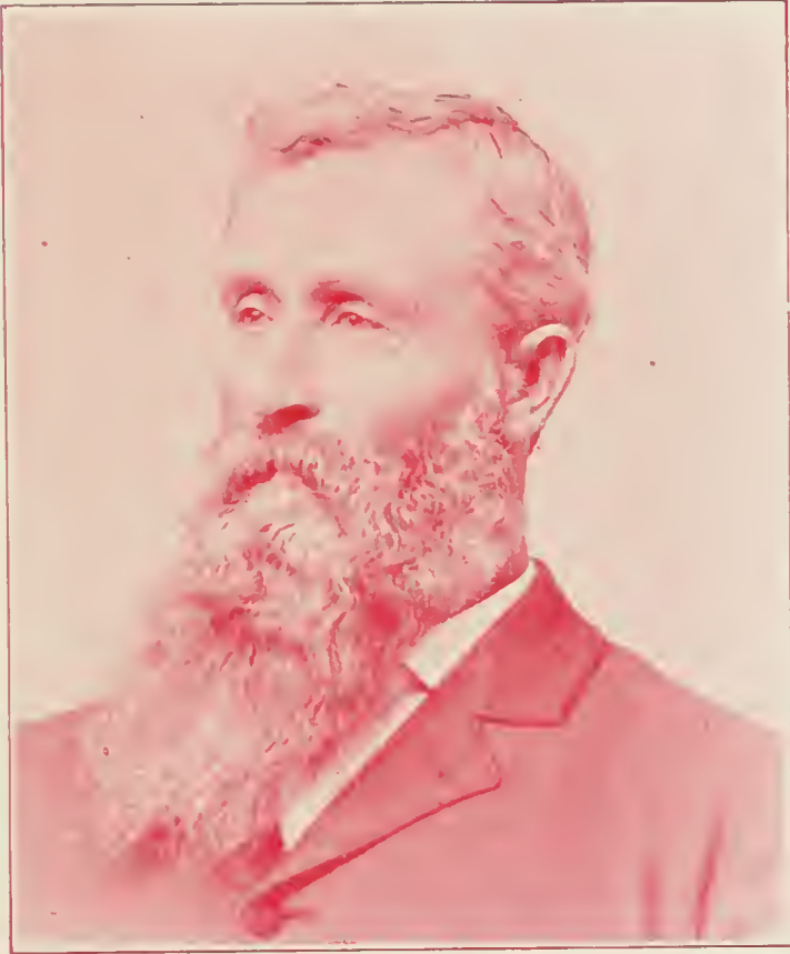
HON. GEORGE D. BOWLING. Ex-State Senator 32 District.